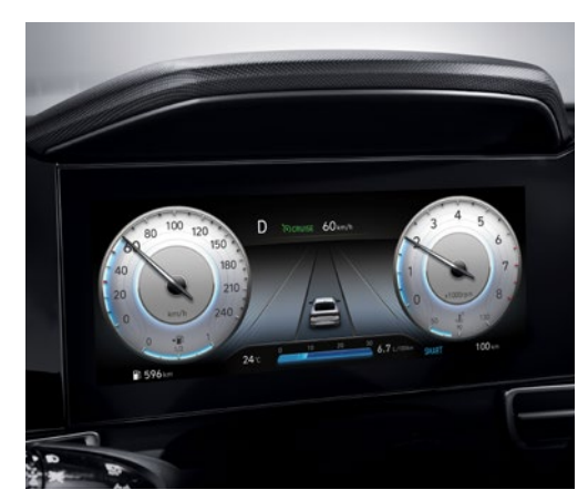
Available 10.25" digital instrument cluster