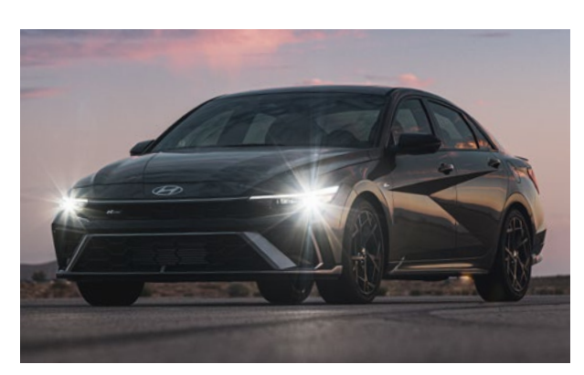
Available LED headlights