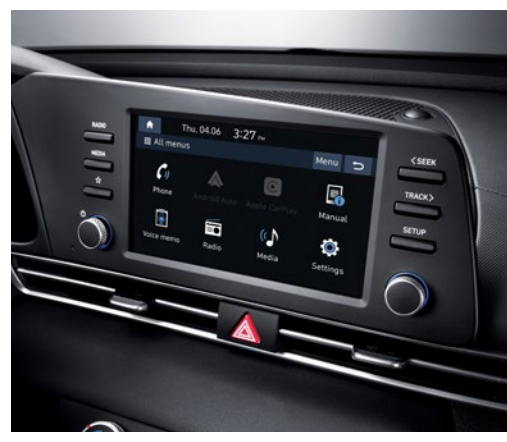
Standard 8.0" touch screen display