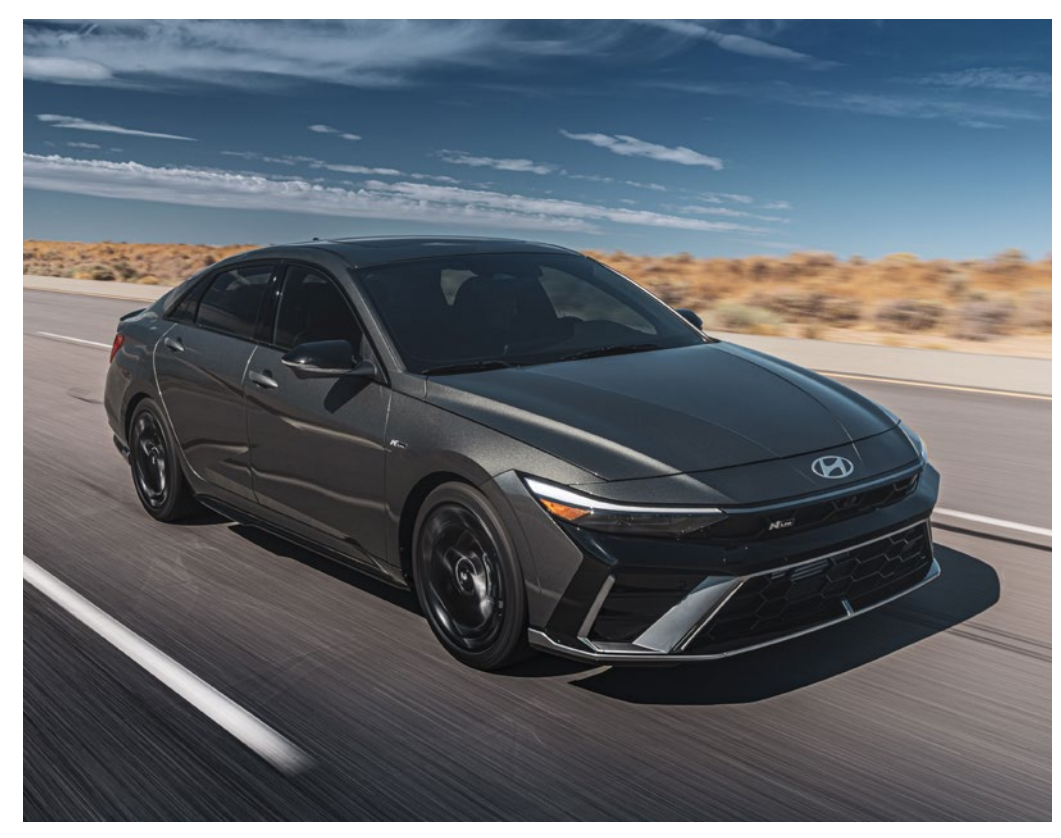
Available N Line front fascia and glossy black grille with emblem

From every angle the ELANTRA delivers a sporty and striking look. Bold, converging character lines create a unique three-dimensional presence along the side. A dominant bold grille up front seamlessly integrates into the headlight architecture and the sleek-edged trunk lid further adds to the confident appearance.