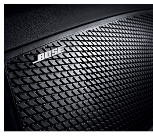
Available Bose® Premium Audio