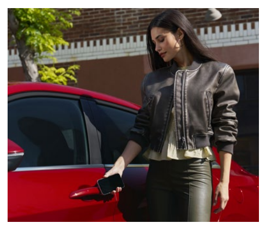
Available Digital Key