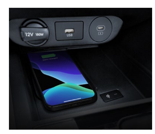
Available wireless charging pad▼