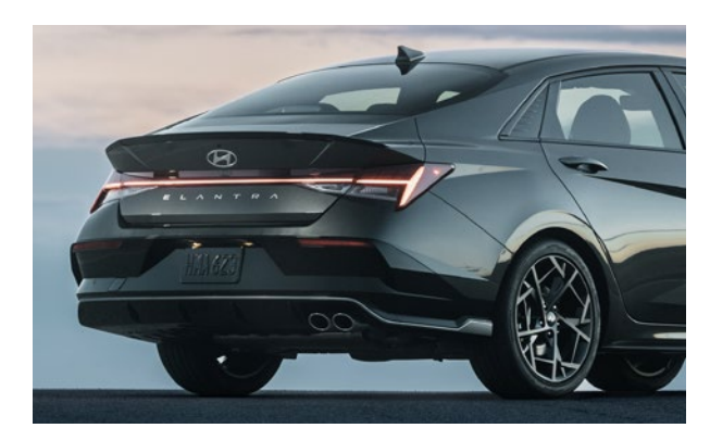
Available LED Taillights Available 18" alloy wheels