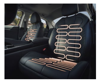
Standard heated front seats and available heated steering wheel