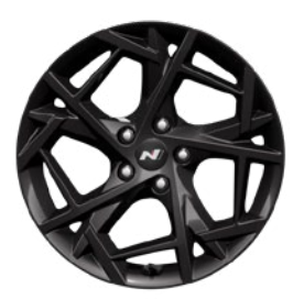
18" alloy wheel Standard on N Line model