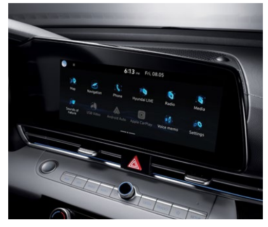
Available 10.25" infotainment touch screen with Navigation