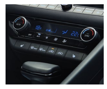
Available dual-zone automatic climate control