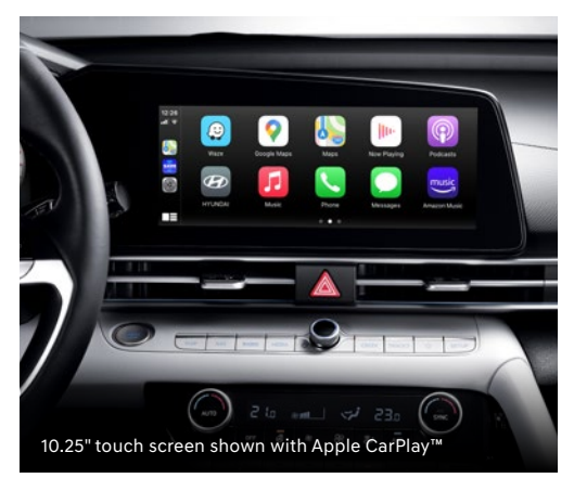
Standard Apple CarPlay™ and Android Auto™ with available wireless connectivity

The features offered in the ELANTRA are nothing short of impressive. When you step inside — using the available proximity key, of course — you are greeted by an available sleek digital instrument cluster, flowing into the available 10.25" touch-screen display with navigation. Add in the available wireless charging pad <sup>▼</sup> and the available Bose® Premium Audio and you'll know what we mean by "transform your drive."