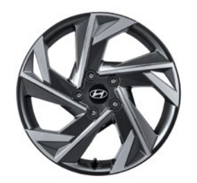
17" alloy wheel Standard on Luxury and Preferred with Tech package models