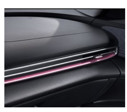
Available interior ambient lighting (64 colour choices)