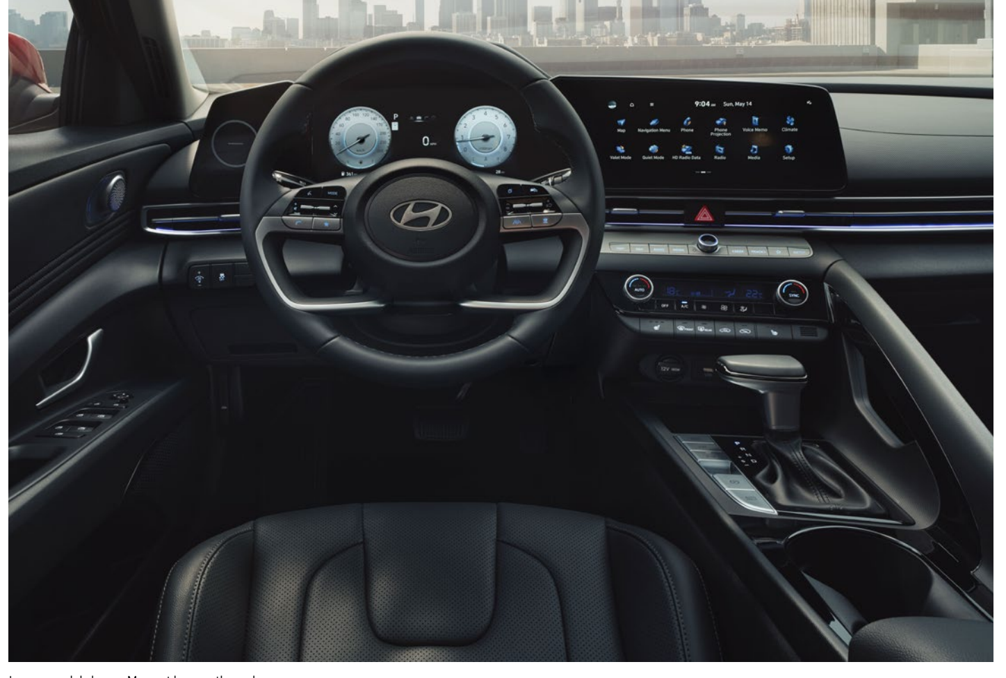
Luxury model shown. May not be exactly as shown.

A number of available features are customizable to your liking, including the 8-way power driver's seat, the interior ambient lighting with 64 colour choices and the dualzone automatic climate control.