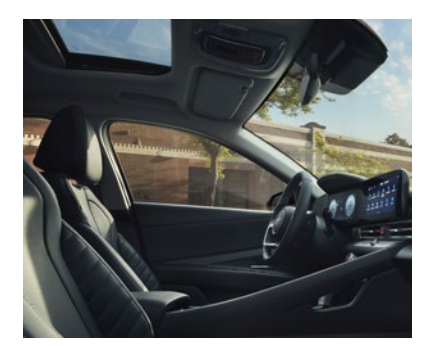
Available power sunroof